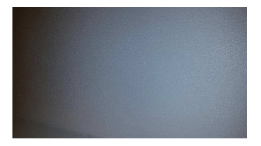
Spray pattern surface 4mm HSC + Enamo Grip working airless 2mm nozzle