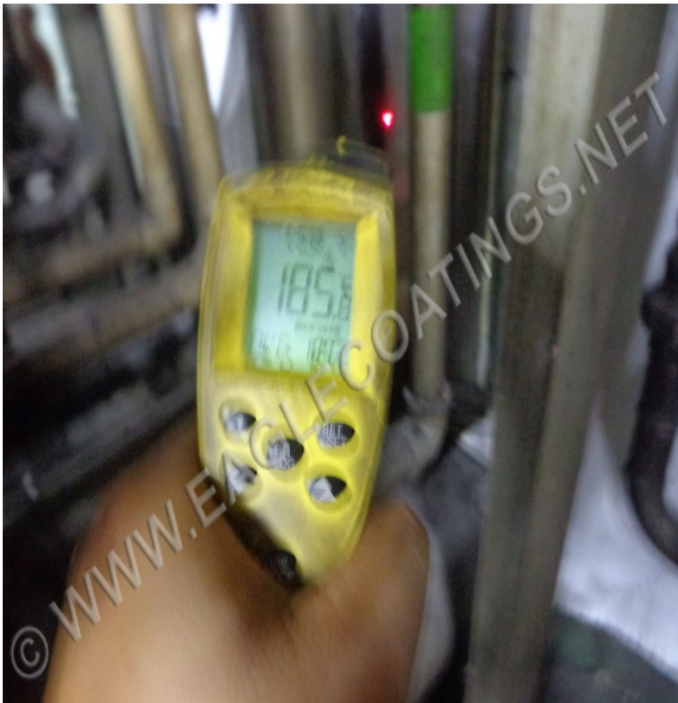
Before HPC ® Application