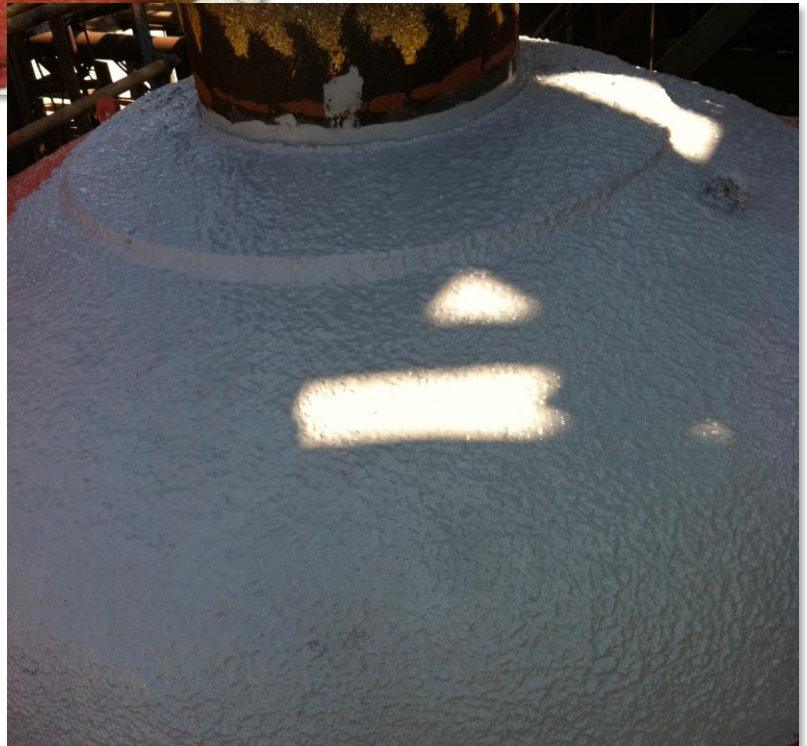
Dome After Application

Application of First layer Enduroof AR (Red) and second layer Enduroof AL (Grey)