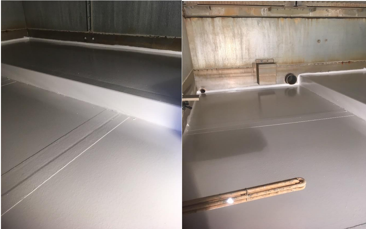
DFT (Dry Film Thickness Reading) after 2 nd coat