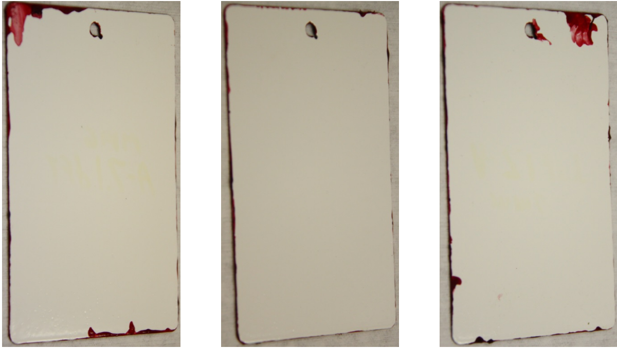
(a) Before Exposure