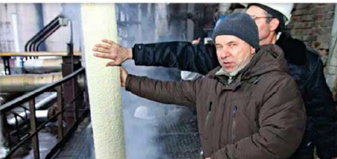
This pipe surface was 467°C (872°F) before coating. These men were able to touch the pipe after only 25mm (1") of HPC® Coating was applied.