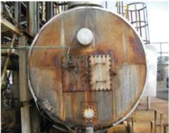
Incinerator before HPC® Coating application was 180°C (356°F).