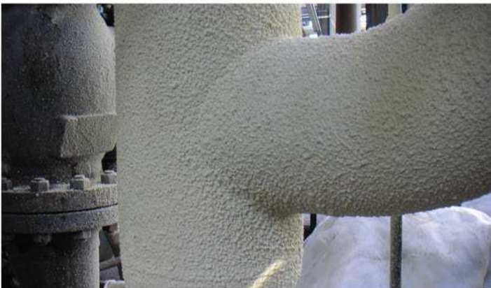
Finished multi-layered HPC® Coating application.