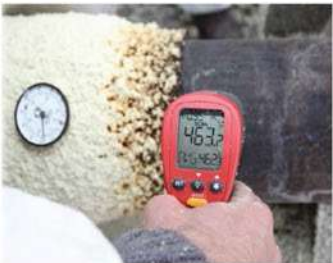
Before HPC® Coating application 463°C (865.4°F).