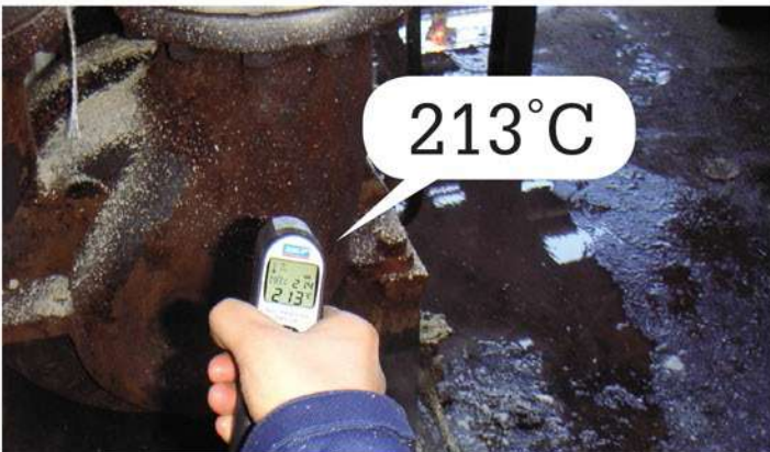
Temperature on the pipe before HPC® Coating was 415.4°F.