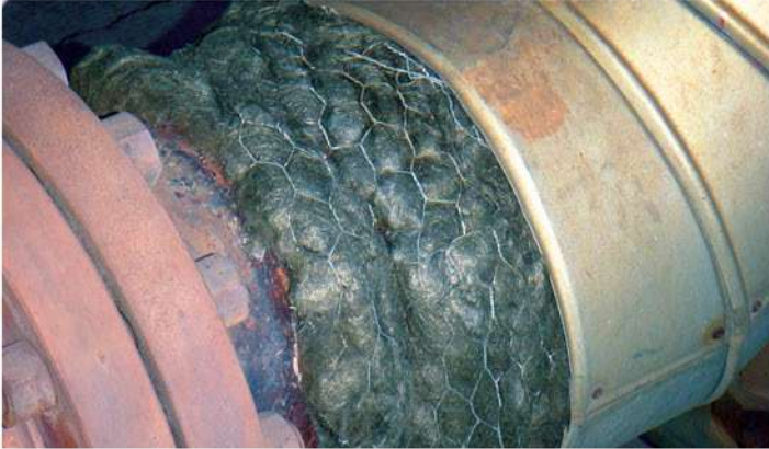
Exposed antiquated insulation.