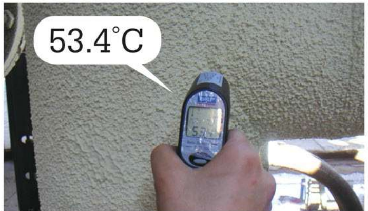
Temperature after HPC® Coating application 128.12°F.