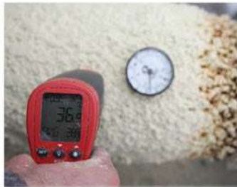
After HPC® Coating application 36°C (96.8°F).