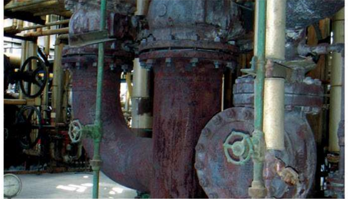
Pipe system before HPC® Coating, extensive CUI.