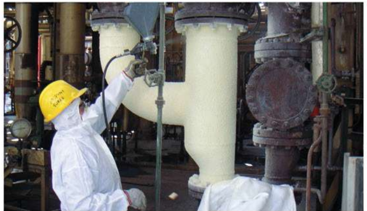
Phase of HPC® Coating application.