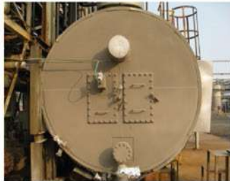
Incinerator after HPC® Coating application was 50°C (122°F).