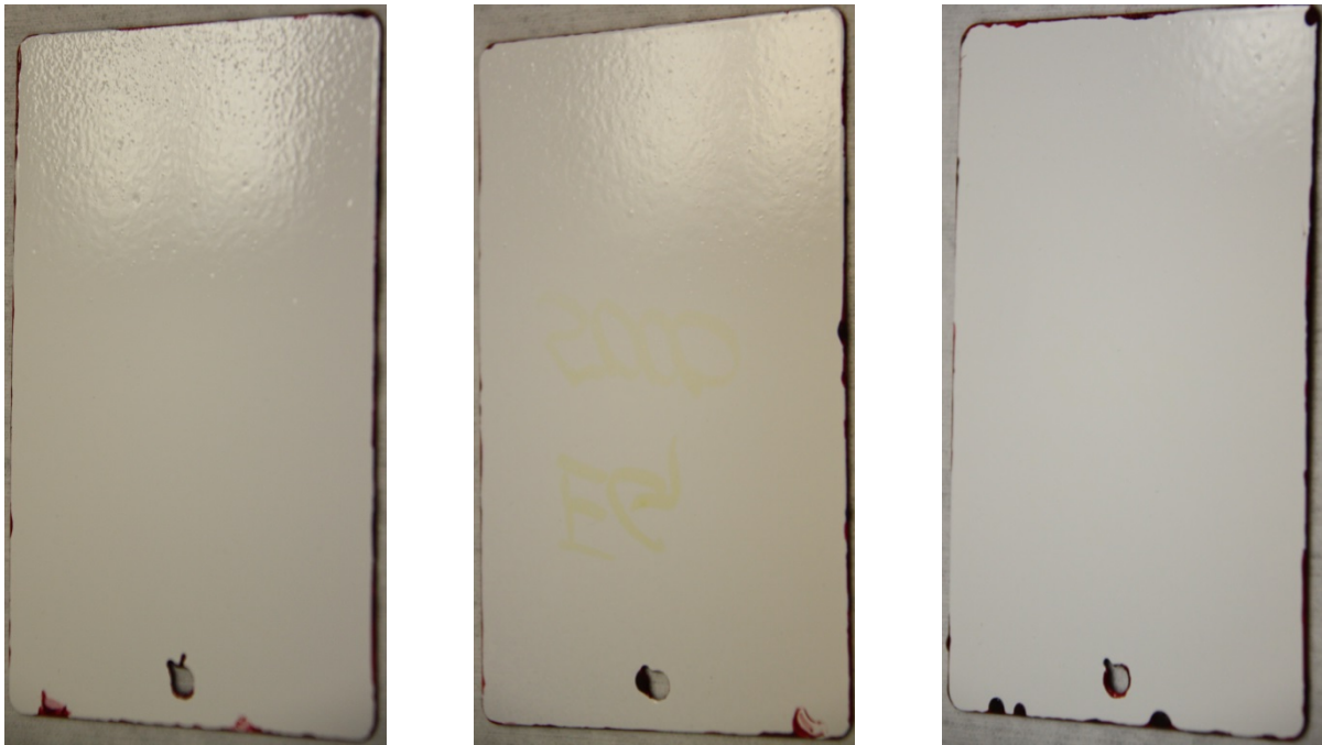
(a) Before Exposure