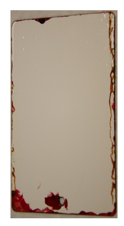
(b) After Exposure

Figure 1. Images of the Moist Metal Grip plus Enamo Grip Coupons (a) Before and (b) After 2000 hours of Exposure in Accordance with ASTM B117