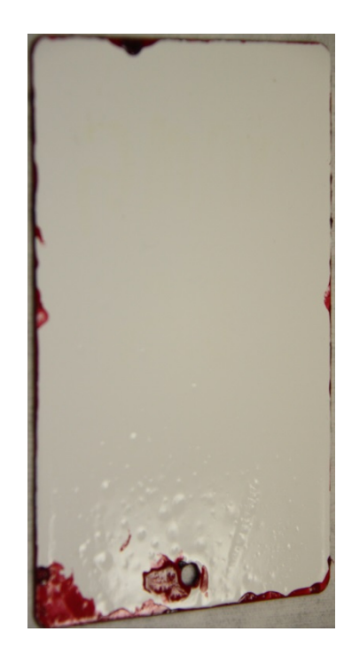
(a) Before Exposure