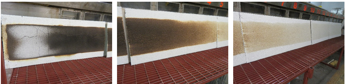
Figure B-2. Exposed side of test decks after fire exposure.