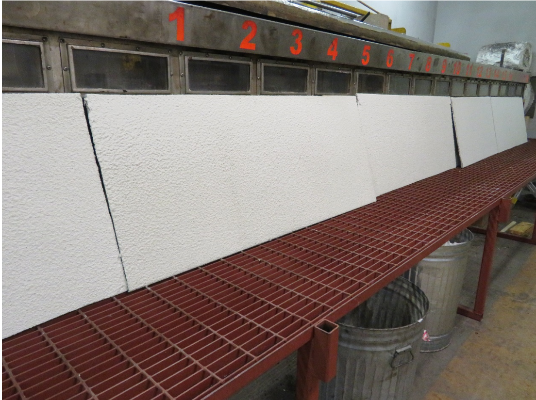
Figure B-1. Exposed side of the deck boards before fire exposure.