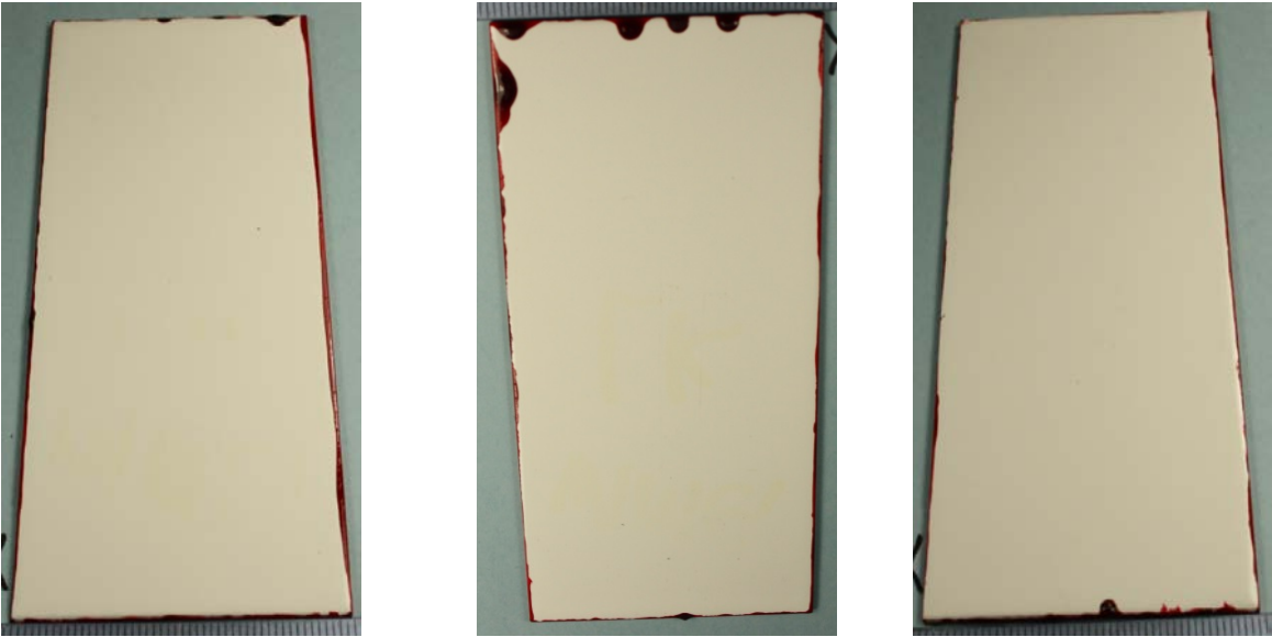
(a) Before Exposure

to minimize edge effect during the testing. The applied paint solution is red in color, and its leachate due to its interaction with the salt solution is yellowish red.