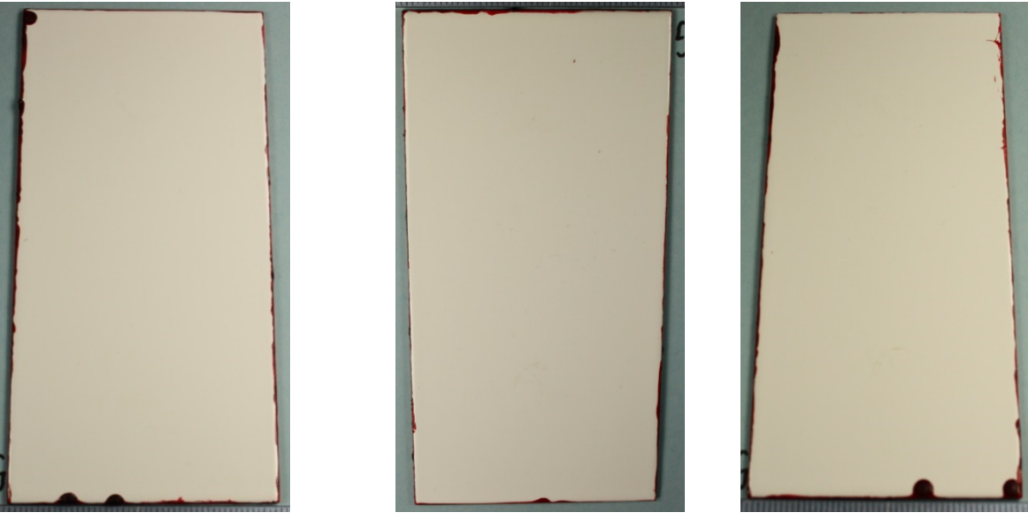
(a) Before Exposure

to minimize edge effect during the testing. The applied paint solution is red in color, and its leachate due to its interaction with the salt solution is yellowish red.